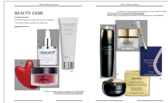
BEAUTY & HEALTH