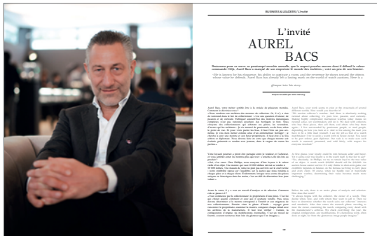
BUSINESS & LEADERS