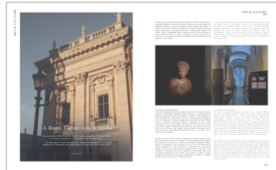
ART & CULTURE